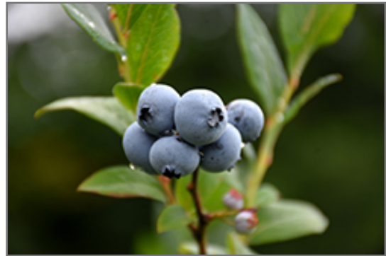
Northsky Blueberry fruit

Northsky Blueberry features dainty clusters of white bell-shaped flowers with shell pink overtones hanging below the branches in mid spring. It has green deciduous foliage. The glossy oval leaves turn an outstanding scarlet in the fall. It features an abundance of magnificent blue berries in mid summer.