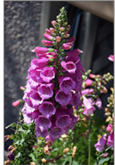
Dalmatian Purple Foxglove flowers

Dalmatian Purple Foxglove is recommended for the following landscape applications;