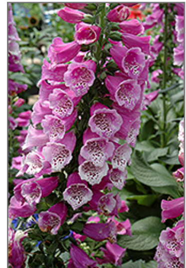
Dalmatian Purple Foxglove flowers