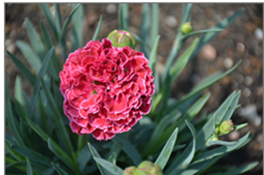
Fruit Punch Raspberry Ruffles Pinks flowers