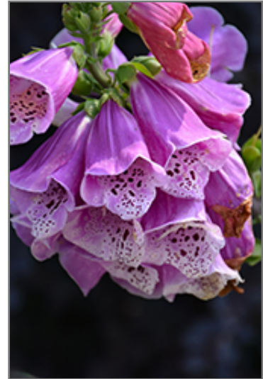
Excelsior Group Foxglove flowers

Excelsior Group Foxglove is recommended for the following landscape applications;