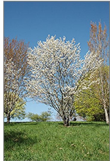
Princess Diana Serviceberry in bloom