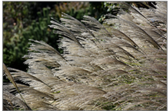
Gracillimus Maiden Grass fruit