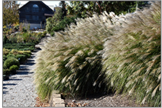
Gracillimus Maiden Grass

Gracillimus Maiden Grass is recommended for the following landscape applications;