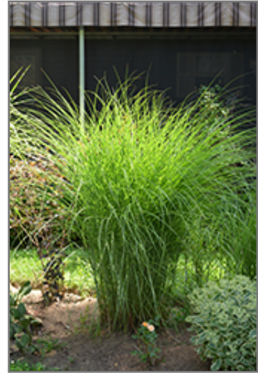
Gracillimus Maiden Grass

This plant does best in full sun to partial shade. It prefers to grow in average to moist conditions, and shouldn't be allowed to dry out. It is not particular as to soil type or pH. It is highly tolerant of urban pollution and will even thrive in inner city environments. This is a selected variety of a species not originally from North America. It can be propagated by division; however, as a cultivated variety, be aware that it may be subject to certain restrictions or prohibitions on propagation.