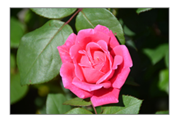
Pink Double Knock Out Rose flowers