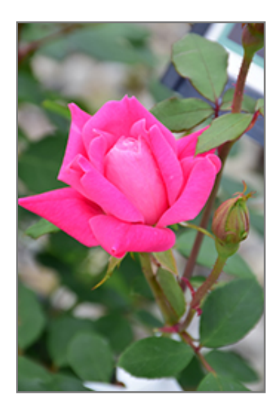
Pink Double Knock Out Rose flowers