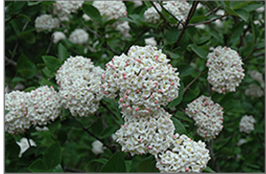
Fragrant Viburnum (tree form) flowers