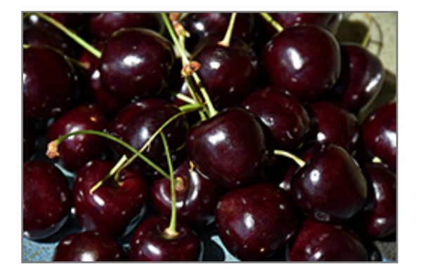
Bing Cherry fruit