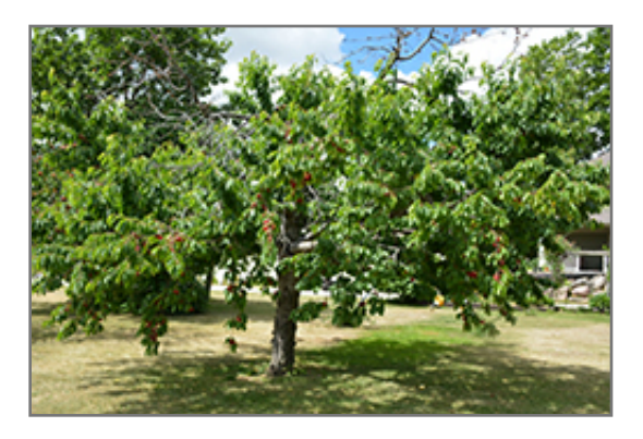
Bing Cherry fruit

This is a deciduous tree with a shapely oval form. Its average texture blends into the landscape, but can be balanced by one or two finer or coarser trees or shrubs for an effective composition. This plant will require occasional maintenance and upkeep, and is best pruned in late winter once the threat of extreme cold has passed. It is a good choice for attracting birds to your yard. Gardeners should be aware of the following characteristic(s) that may warrant special consideration;