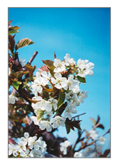
Bing Cherry flowers