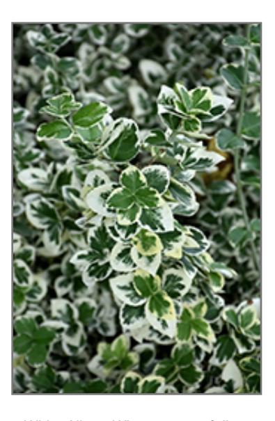
White Album Wintercreeper foliage