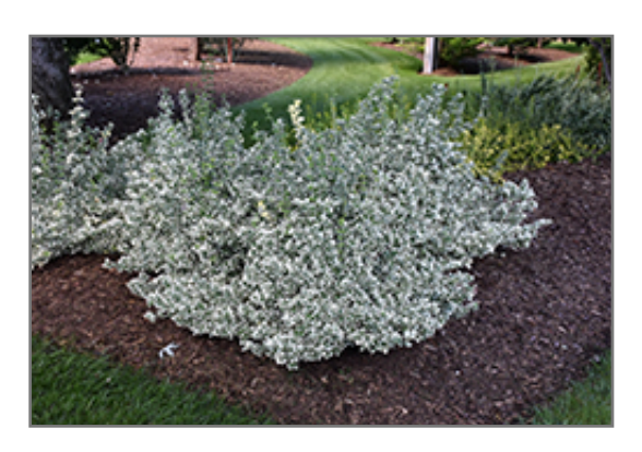
White Album Wintercreeper