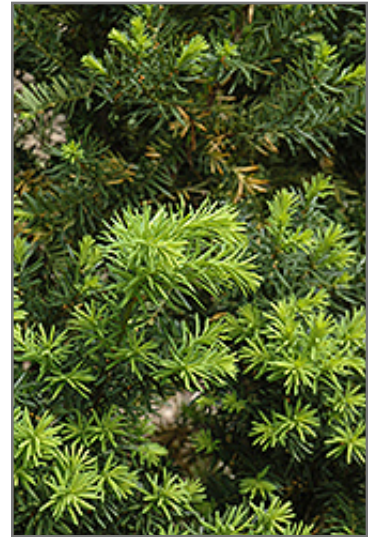
Hicks Yew foliage