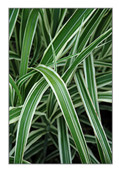
Cosmopolitan Maiden Grass foliage