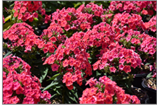
Flame Coral Garden Phlox flowers Photo courtesy of NetPS Plant Finder

Flame Coral Garden Phlox will grow to be about 14 inches tall at maturity extending to 20 inches tall with the flowers, with a spread of 18 inches. When grown in masses or used as a bedding plant, individual plants should be spaced approximately 15 inches apart. It grows at a medium rate, and under ideal conditions can be expected to live for approximately 10 years. As an herbaceous perennial, this plant will usually die back to the crown each winter, and will regrow from the base each spring. Be careful not to disturb the crown in late winter when it may not be readily seen!