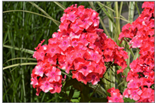
Flame Coral Garden Phlox flowers