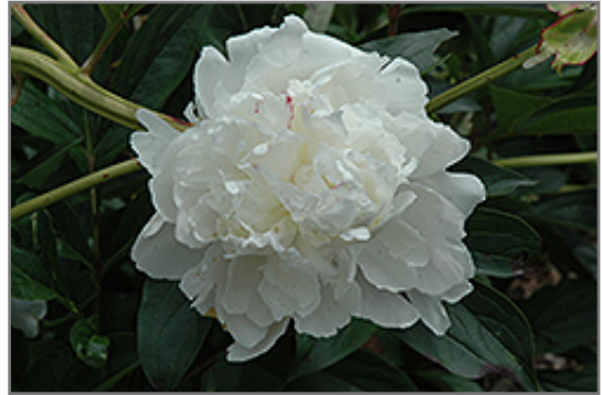
Festiva Peony flowers