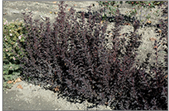
Tiny Wine Ninebark

This shrub does best in full sun to partial shade. It is very adaptable to both dry and moist locations, and should do just fine under average home landscape conditions. It is not particular as to soil type or pH. It is highly tolerant of urban pollution and will even thrive in inner city environments. This is a selection of a native North American species.