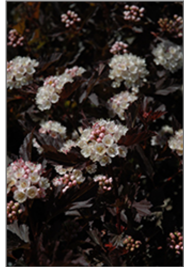
Tiny Wine Ninebark flowers

This shrub will require occasional maintenance and upkeep, and can be pruned at anytime. It has no significant negative characteristics.