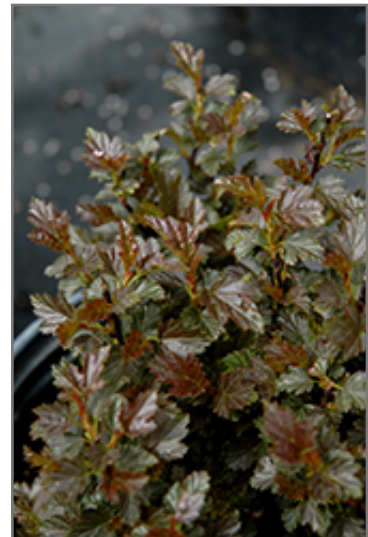
Tiny Wine Ninebark foliage