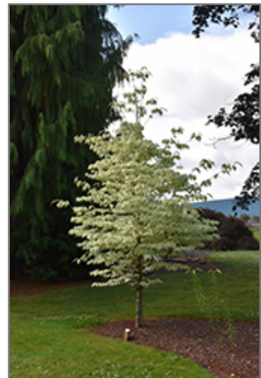
Summer Fun Chinese Dogwood