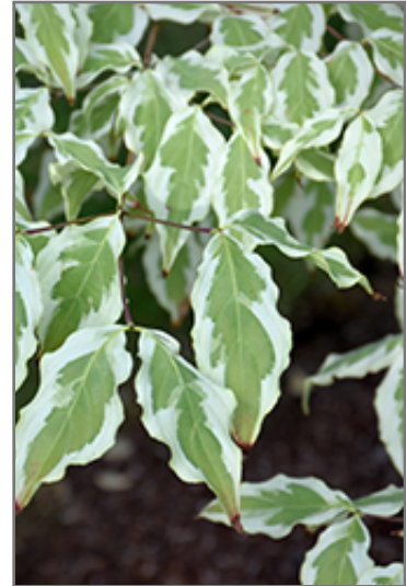
Summer Fun Chinese Dogwood foliage