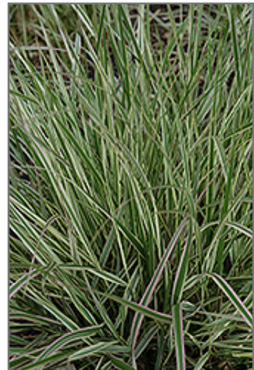
Variegated Reed Grass foliage