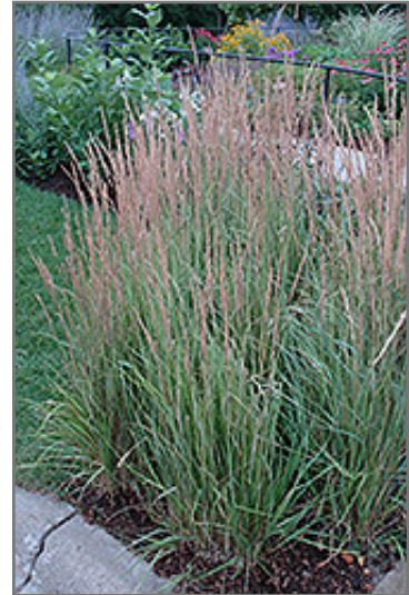
Variegated Reed Grass in bloom

This plant will require occasional maintenance and upkeep, and is best cut back to the ground in late winter before active growth resumes. It has no significant negative characteristics.