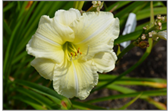
Joan Senior Daylily flowers

Elegant and beautiful, these lightly ruffled, creamy white flowers with chartreuse throats stand out against arching green foliage; early-midseason bloomer, great for borders, beds and small gardens; heat and drought tolerant; low maintenance