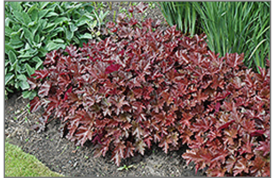
Chocolate Ruffles Coral Bells

This is a relatively low maintenance plant, and should be cut back in late fall in preparation for winter. It is a good choice for attracting hummingbirds to your yard. It has no significant negative characteristics.