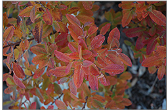
Rainbow Pillar Serviceberry in fall