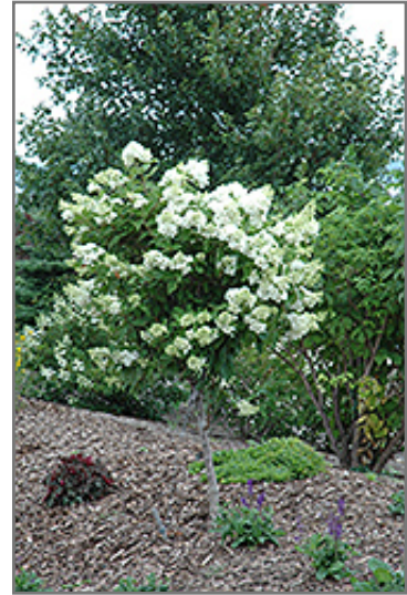
Pink Diamond Hydrangea (tree form) in bloom

Pink Diamond Hydrangea (tree form) will grow to be about 8 feet tall at maturity, with a spread of 6 feet. It tends to be a little leggy, with a typical clearance of 3 feet from the ground, and is suitable for planting under power lines. It grows at a medium rate, and under ideal conditions can be expected to live for 40 years or more.