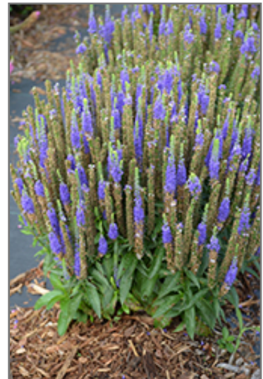
Royal Candles Speedwell in bloom