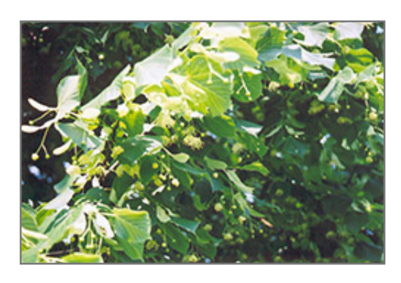
Littleleaf Linden flowers