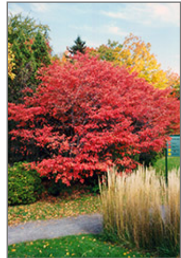
Shadblow Serviceberry in fall