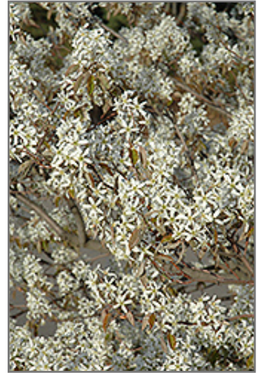
Shadblow Serviceberry flowers

This shrub does best in full sun to partial shade. It is quite adaptable, preferring to grow in average to wet conditions, and will even tolerate some standing water. It is not particular as to soil type or pH. It is somewhat tolerant of urban pollution. This species is native to parts of North America.