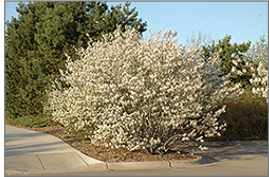
Shadblow Serviceberry in bloom

Shadblow Serviceberry is a multi-stemmed deciduous shrub with an upright spreading habit of growth. Its average texture blends into the landscape, but can be balanced by one or two finer or coarser trees or shrubs for an effective composition.