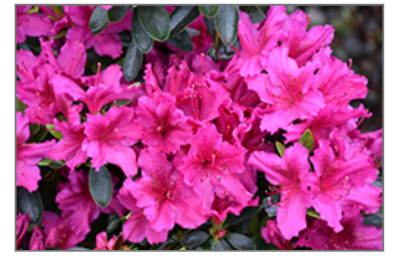
Girard's Fuchsia Evergreen Azalea flowers