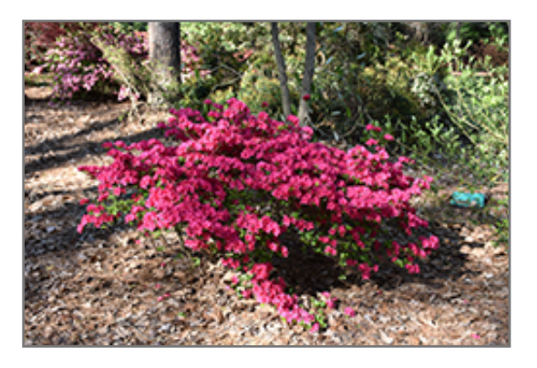
Girard's Fuchsia Evergreen Azalea in bloom

7010 Hwy #3 Maidstone Tecumseh Ontario NOR 1K0 P: 519.737.2999 F: 519.737.1519