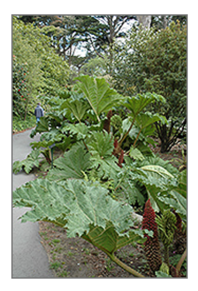
Giant Rhubarb in bloom