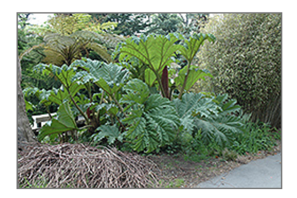
Giant Rhubarb

Giant Rhubarb is recommended for the following landscape applications;