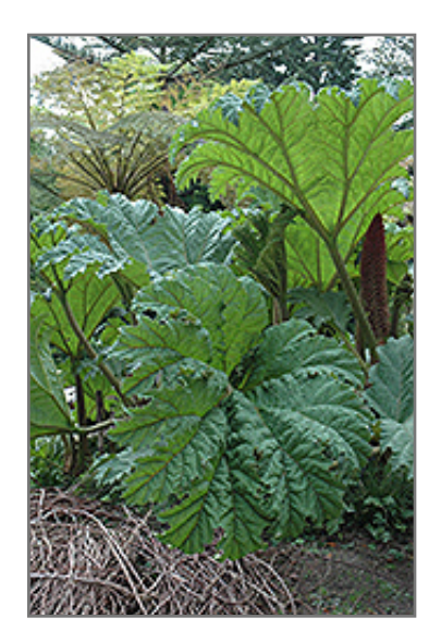
Giant Rhubarb foliage

This plant does best in full sun to partial shade. It prefers to grow in moist to wet soil, and will even tolerate some standing water. It is not particular as to soil pH, but grows best in rich soils. It is highly tolerant of urban pollution and will even thrive in inner city environments. This species is not originally from North America.